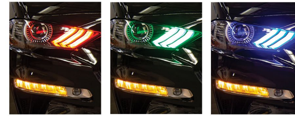
Red Green Blue