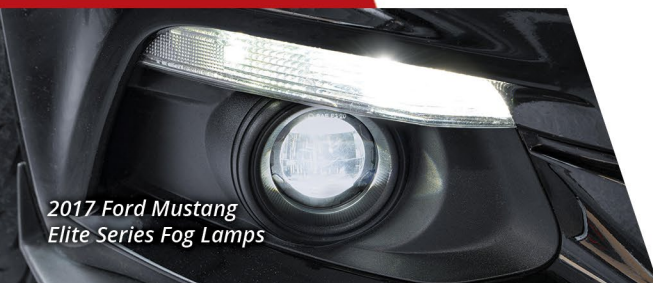
2017 Ford Mustang Elite Series Fog Lamps