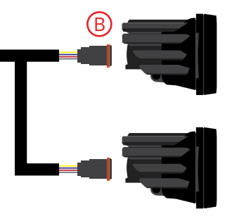
7-Pin Trailer Harness Connector