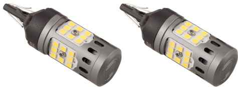
7440/7443 XPR Backup LED Bulbs