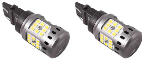
3156/3157 XPR Backup LED Bulbs