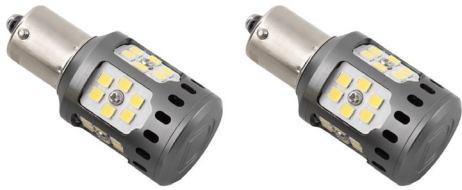
1156 XPR Backup LED Bulbs