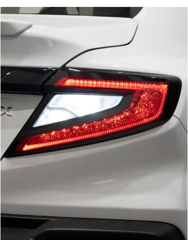
Additional Backup Lights