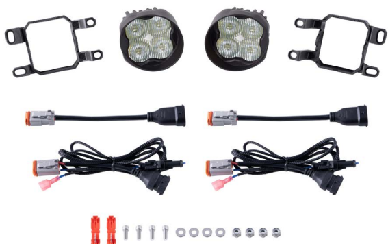
SS3 Type CGX Fog Light Kit