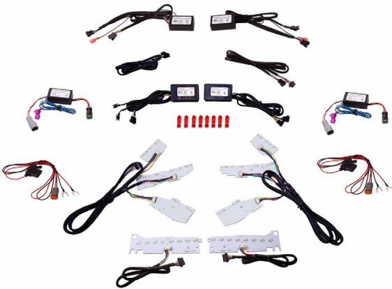
Chevrolet Camaro ZL1 Upper and Lower RGBW DRL Boards