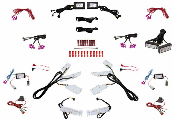
Chevrolet Camaro ZL1 Upper and Lower RGBWA DRL Boards