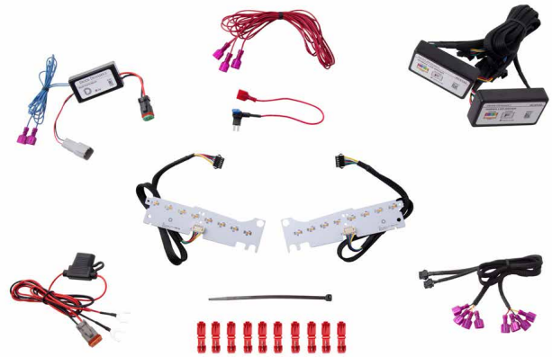
Chevrolet Camaro ZL1 Lower RGBWA DRL Boards